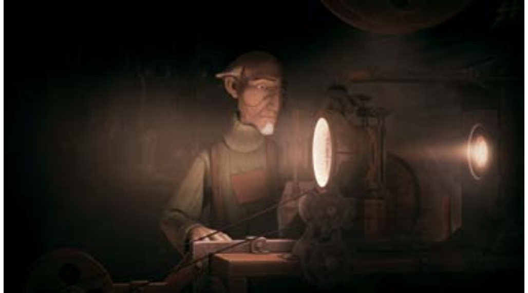
The Kinematograph

Help inspire students to pursue careers in games, film, television, and visual effects with the Autodesk Education Suite for Entertainment Creation, a comprehensive technology suite that provides powerful computer graphics tools and access to a variety of online curriculum and self-paced resources.